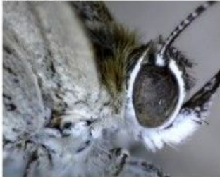
Butterfly with EDOF