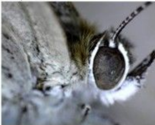
Butterfly without EDOF