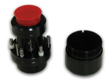
Holder capping the HyperStar