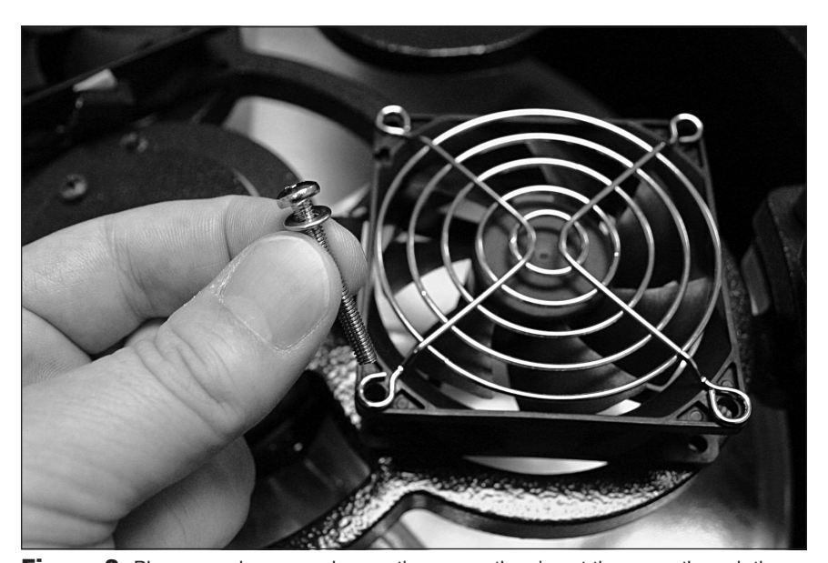
Figure 2. Place a washer on each mounting screw, then insert the screw through the wire cover and fan and into the threaded hole in the metal support cell. Tighten all four screws to secure each fan in place.