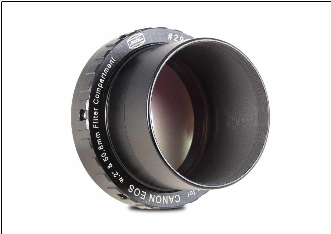
Fig. 3: Illustration: Protective T-Ring for Canon EOS with 2" socket (S52/2")