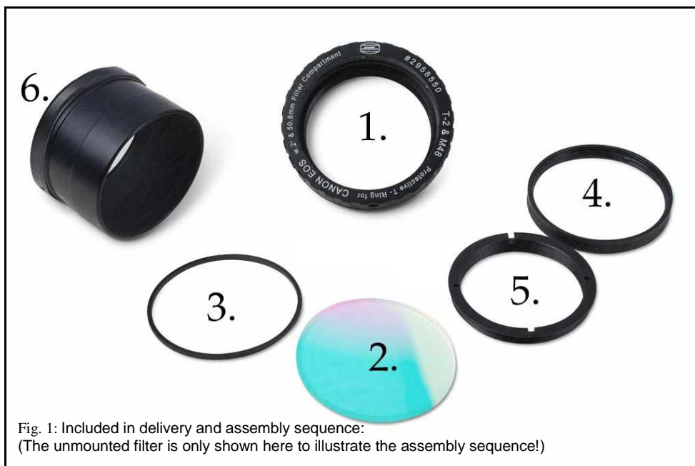
Fig. 1: Included in delivery and assembly sequence: (The unmounted filter is only shown here to illustrate the assembly sequence!)

When supplied with filter, a Baader clear protective 50.4mm filter is built in to the Protective T-ring for the CANON EOS for example. The S52/M48 adapter, as well as the M48/T-2 insert ring, are similarly pre-assembled – however, the M48/T-2 insert ring is only loosely screwed in.