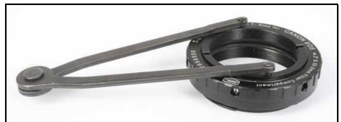
Fig. 8A: Optional, adjustable 2mm face spanner (#2450062)