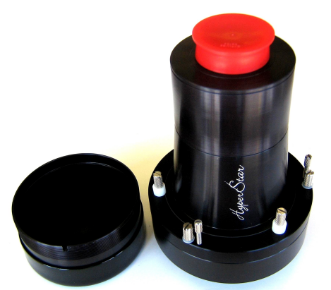
Secondary mirror holder and HyperStar lens (with camera adapter attached)