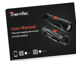
User manual (x1)